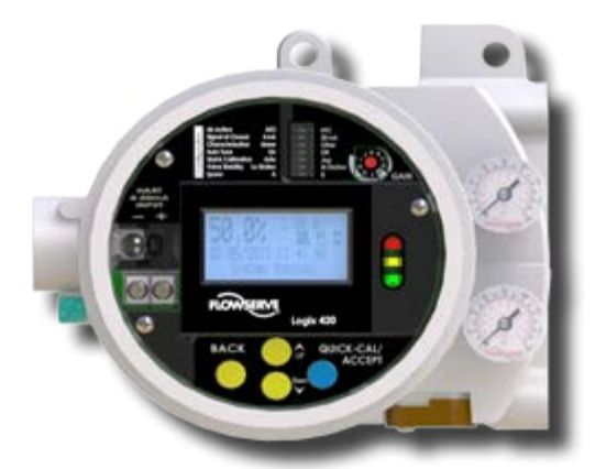
The Logix® 420 User Interface

ValveSight ™ DTM Software: Intuitive DTM software provides a powerful user interface for all positioner commissioning, monitoring and diagnostic functions and custom settings.