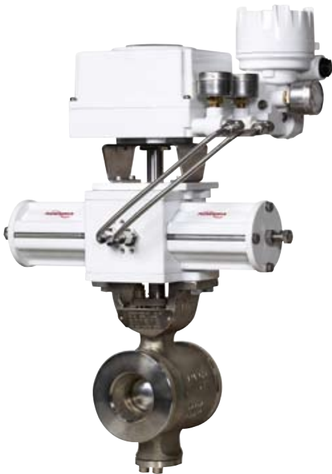
Valtek ShearStream SB

Effective control for demanding flows. After more than one hundred years of close cooperation with our customers, we at Flowserve know what it is all about. Our robust valve and actuators, together with our advanced positioners, are designed to cope with the demands and control of all types of flowing media. With the focus on performance. Flowserve's products are compact, modular-built, high performance packages that are optimized for exact control and cost-effective continuous operation. They have an extremely long life span as all parts are of highest quality. And they'll still be safe in the future as they use advanced technology and innovative solutions. Flowserve ensures a safe and cost-effective operation for our customers all over the world